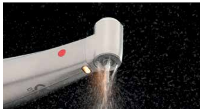
Unbelievably quiet: T1 LINE with the new 4-nozzle spray.