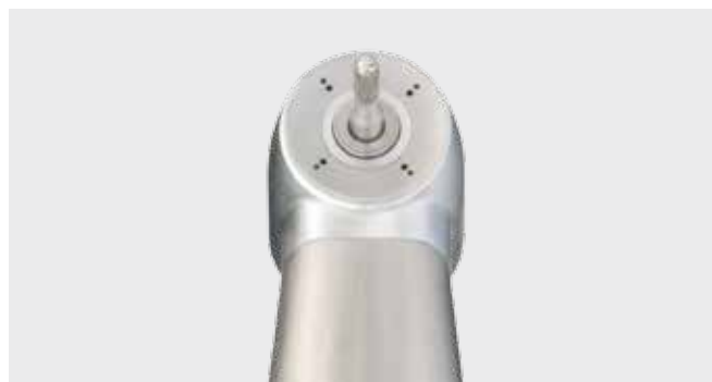
Noise-free comfort: T3 LINE with the quiet 4-nozzle spray.