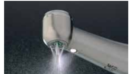
The 4-nozzle spray makes the T1 turbines the quietest in their class.