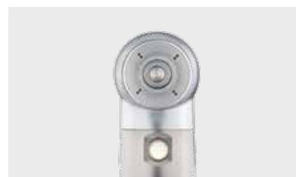
Low noise level: T2 turbines with 4-nozzle spray