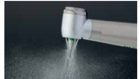
Extremely quiet: T3 turbines with 4-nozzle spray