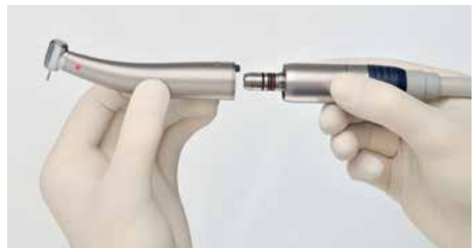
With T2 LINE you benefit from the flexible ISO interface and the quiet 4-nozzle spray.